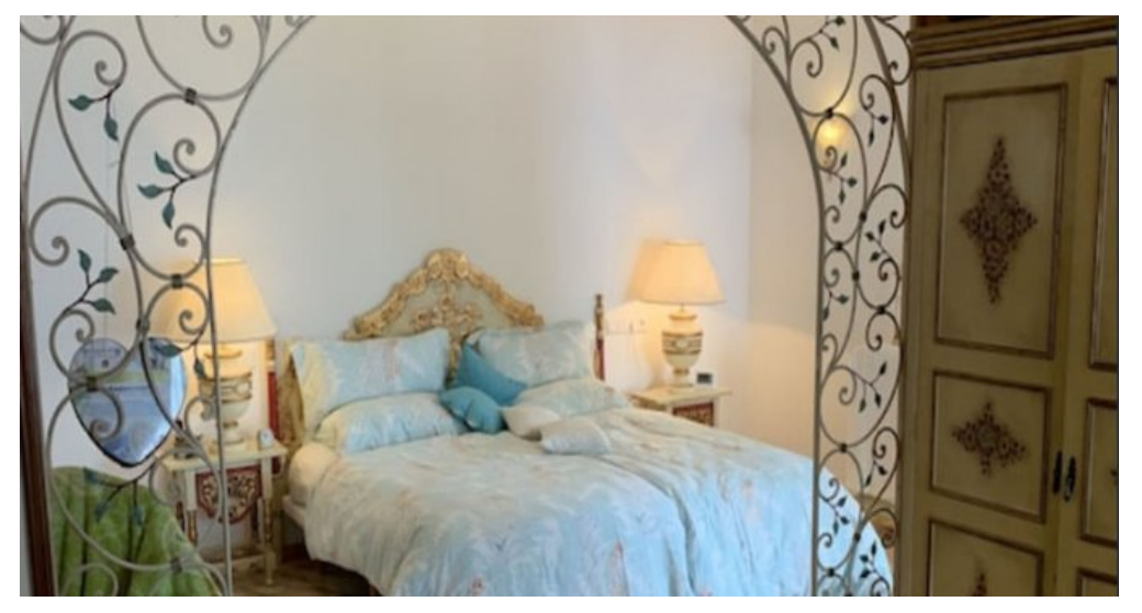
Exklusives Ferienhaus - Spanien - Costa Brava - privater Pool - Meerblick