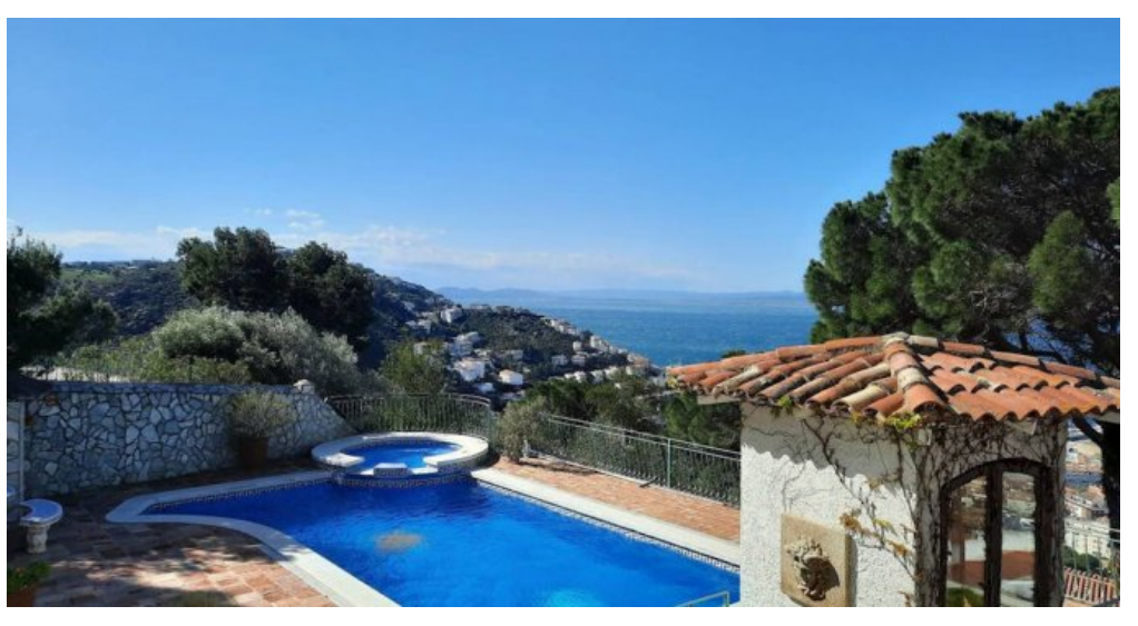
Exklusives Ferienhaus - Spanien - Costa Brava - privater Pool - Meerblick