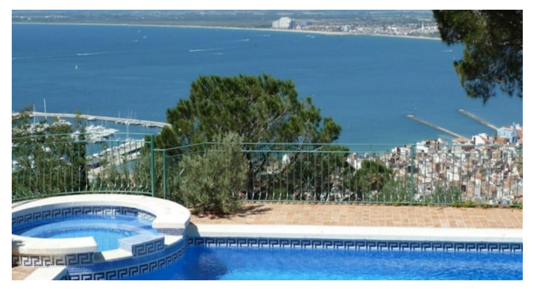
Exklusives Ferienhaus - Spanien - Costa Brava - privater Pool - Meerblick