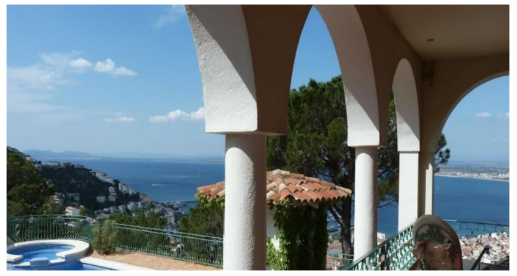
Exklusives Ferienhaus - Spanien - Costa Brava - privater Pool - Meerblick