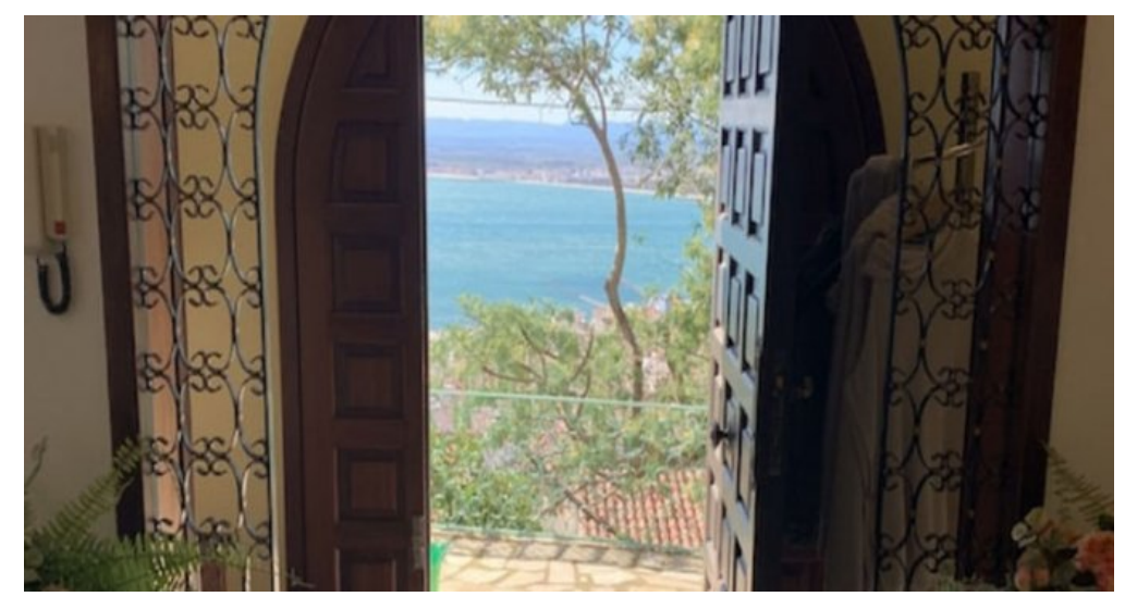
Exklusives Ferienhaus - Spanien - Costa Brava - privater Pool - Meerblick