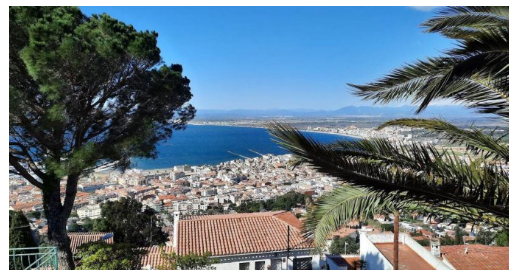
Exklusives Ferienhaus - Spanien - Costa Brava - privater Pool - Meerblick