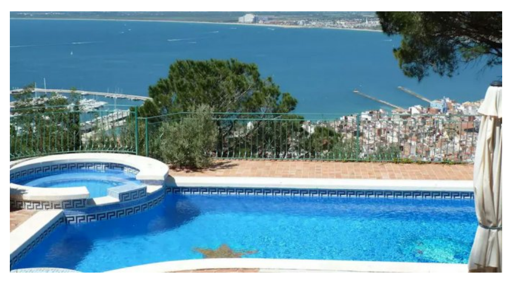
Exklusives Ferienhaus - Spanien - Costa Brava - privater Pool - Meerblick