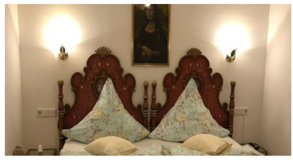
Exklusives Ferienhaus - Spanien - Costa Brava - privater Pool - Meerblick