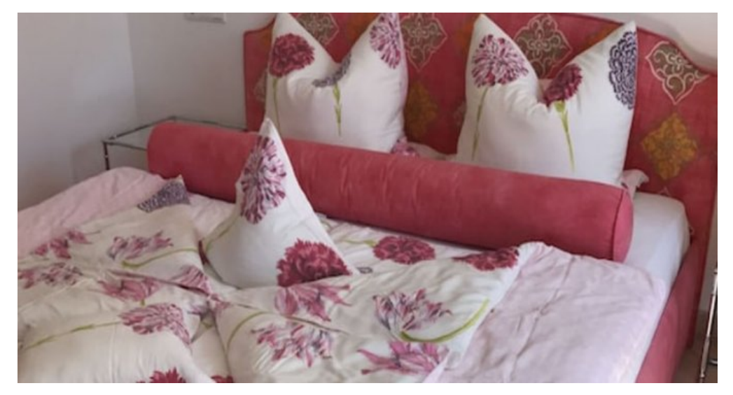
Exklusives Ferienhaus - Spanien - Costa Brava - privater Pool - Meerblick