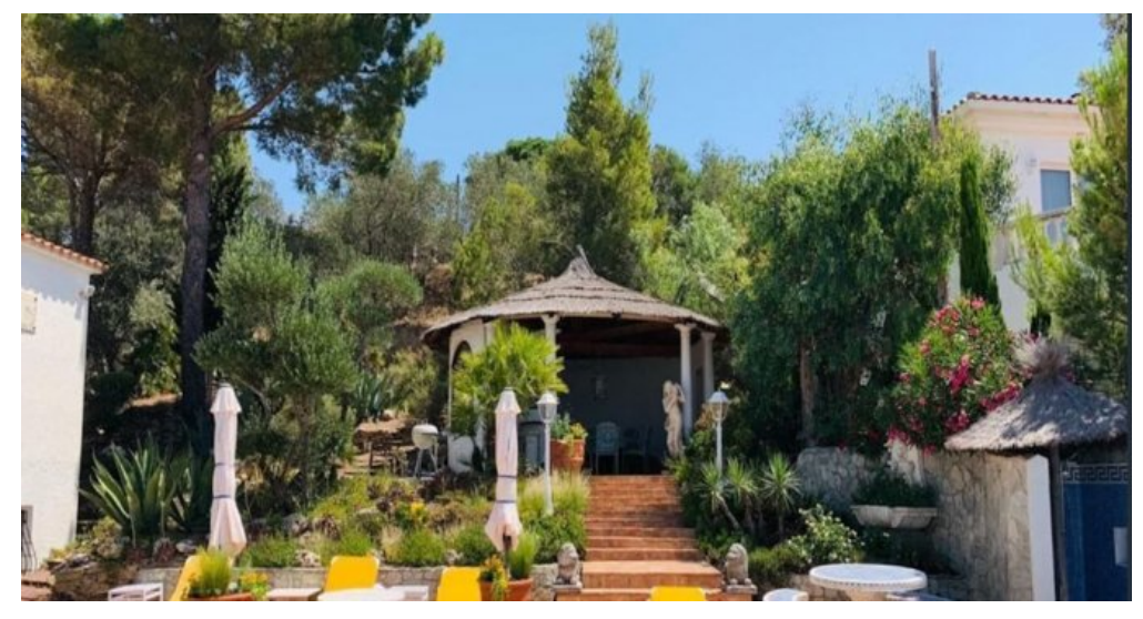
Exklusives Ferienhaus - Spanien - Costa Brava - privater Pool - Meerblick