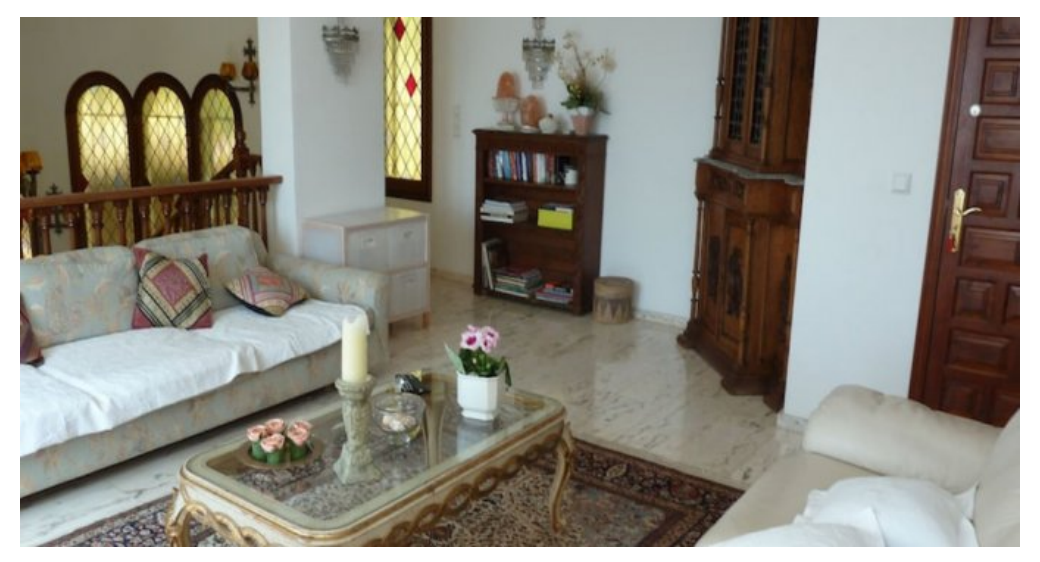
Exklusives Ferienhaus - Spanien - Costa Brava - privater Pool - Meerblick