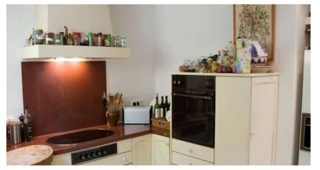
Exklusives Ferienhaus - Spanien - Costa Brava - privater Pool - Meerblick