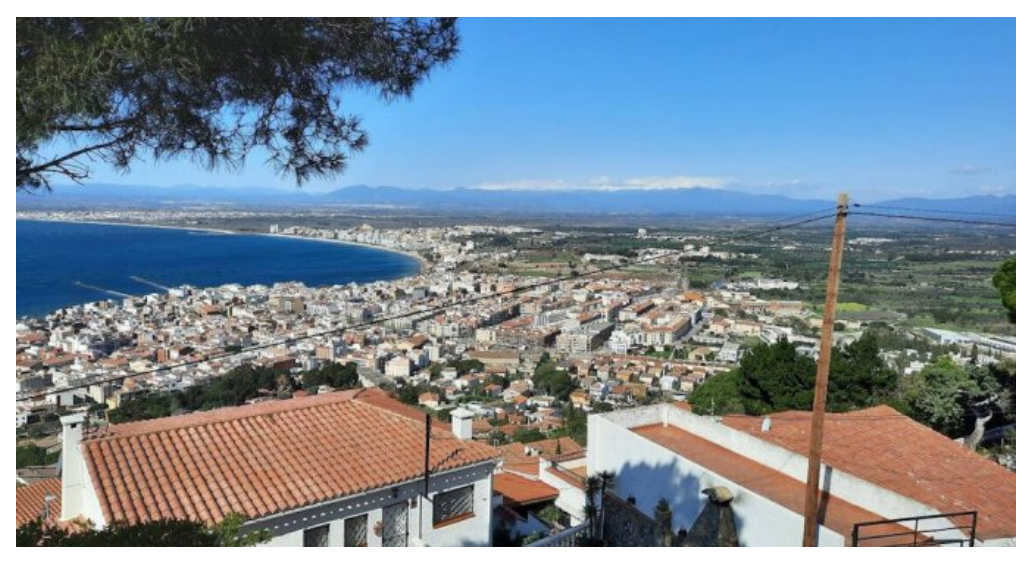
Exklusives Ferienhaus - Spanien - Costa Brava - privater Pool - Meerblick