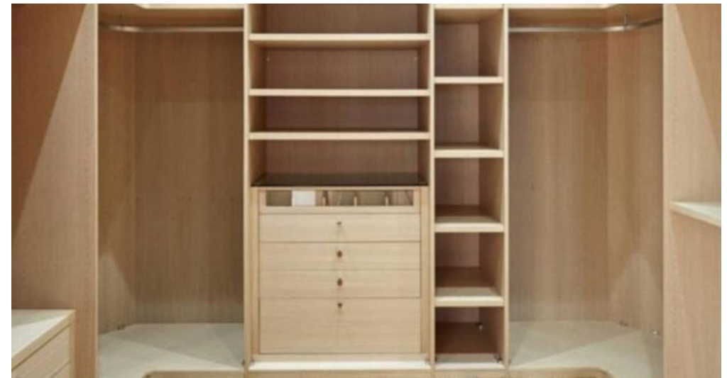
Neubau Feienhaus Lloret de Mar - Spanien kaufen