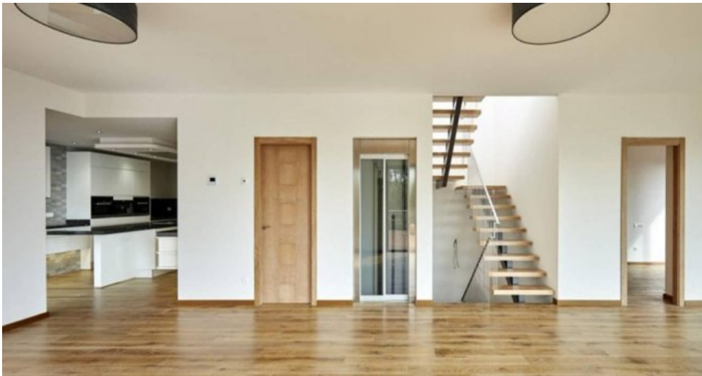
Neubau Feienhaus Lloret de Mar - Spanien kaufen