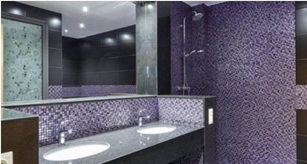
Neubau Feienhaus Lloret de Mar - Spanien kaufen