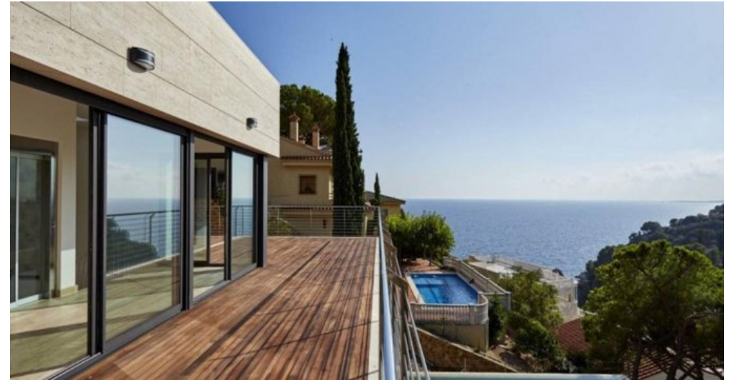
Neubau Feienhaus Lloret de Mar - Spanien kaufen