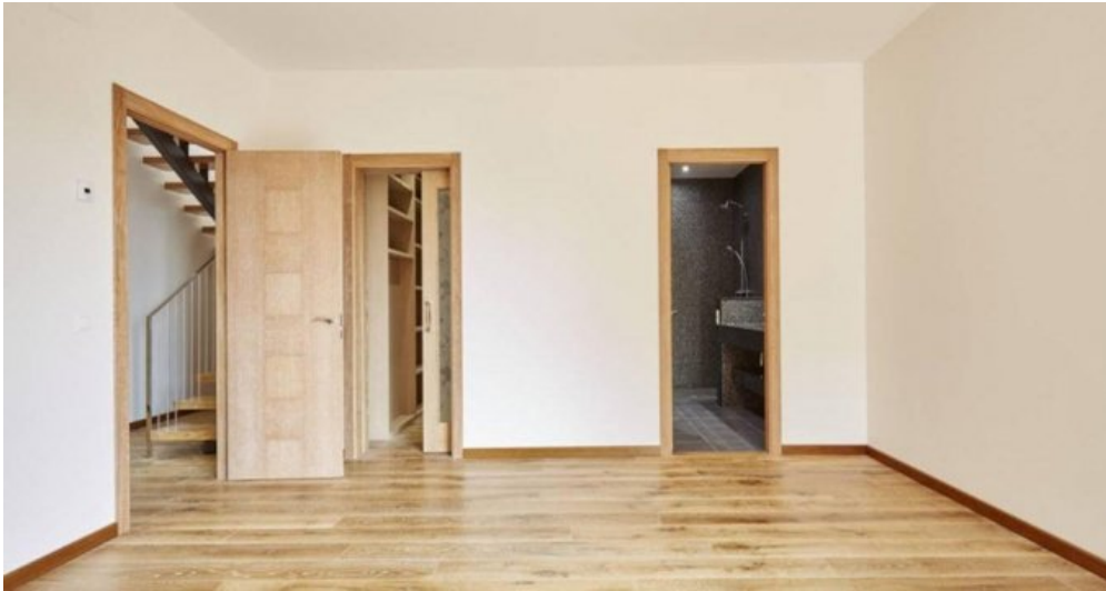
Neubau Feienhaus Lloret de Mar - Spanien kaufen