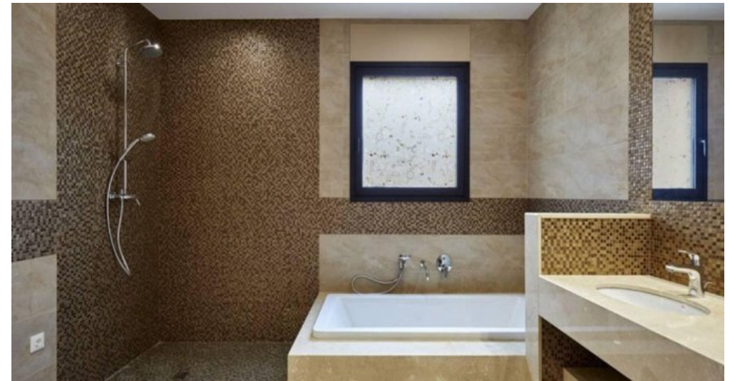
Neubau Feienhaus Lloret de Mar - Spanien kaufen