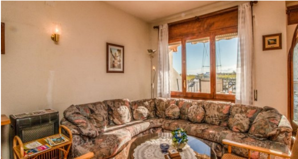
Appartement in Strandnähe in Empuriabrava