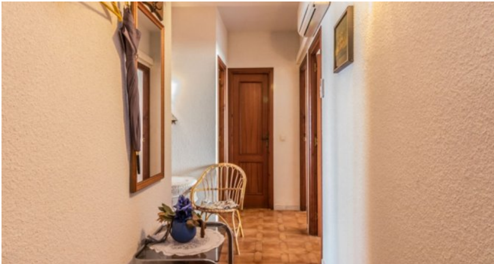
Appartement in Strandnähe in Empuriabrava