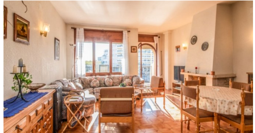
Appartement in Strandnähe in Empuriabrava