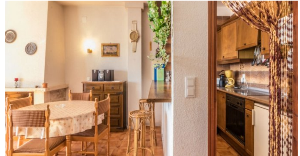
Appartement in Strandnähe in Empuriabrava