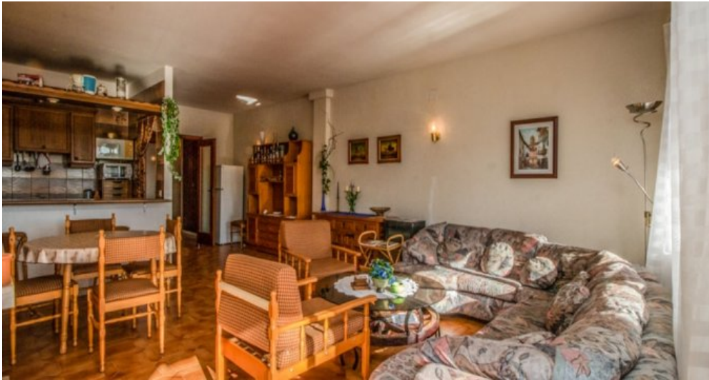
Appartement in Strandnähe in Empuriabrava