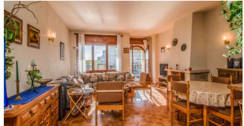
Appartement in Strandnähe in Empuriabrava