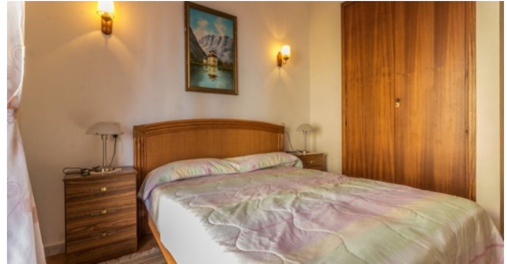
Appartement in Strandnähe in Empuriabrava