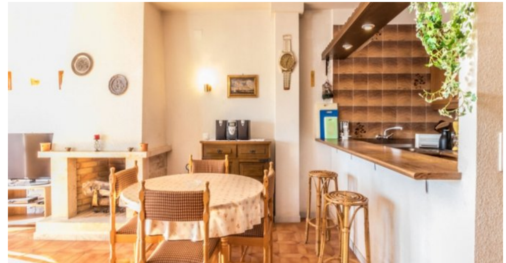
Appartement in Strandnähe in Empuriabrava