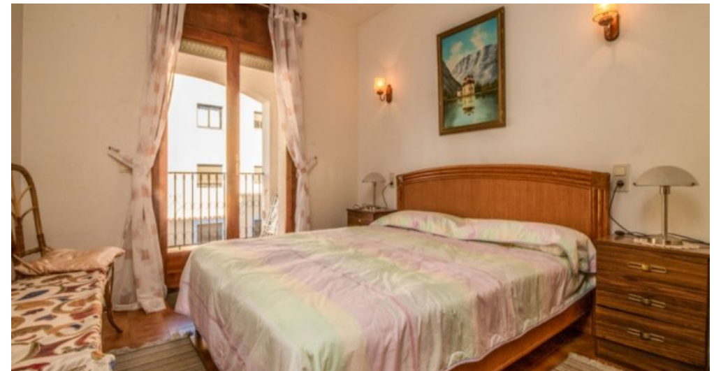
Appartement in Strandnähe in Empuriabrava