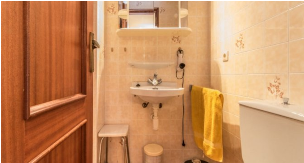
Appartement in Strandnähe in Empuriabrava