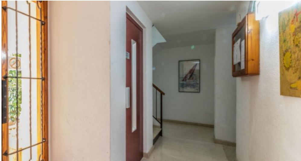
Appartement in Strandnähe in Empuriabrava