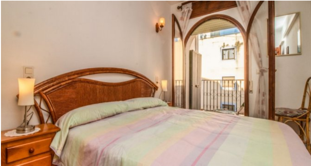
Appartement in Strandnähe in Empuriabrava