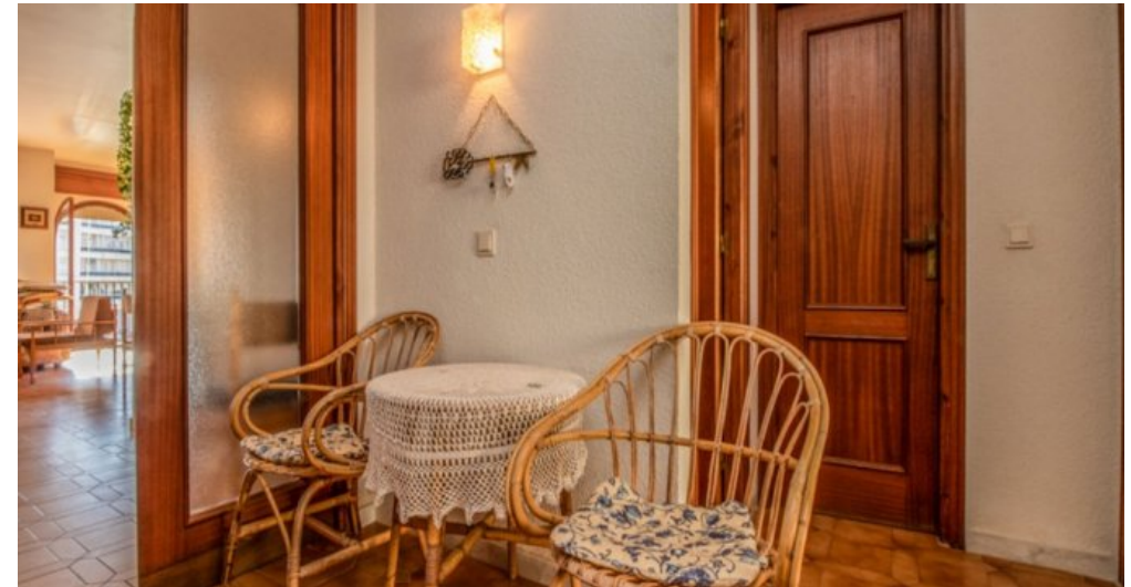
Appartement in Strandnähe in Empuriabrava