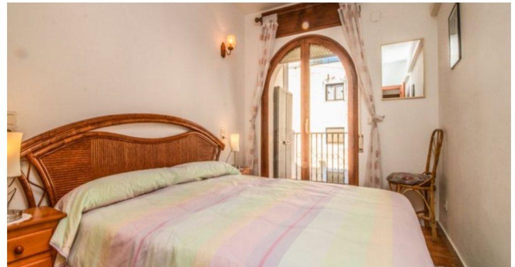
Appartement in Strandnähe in Empuriabrava