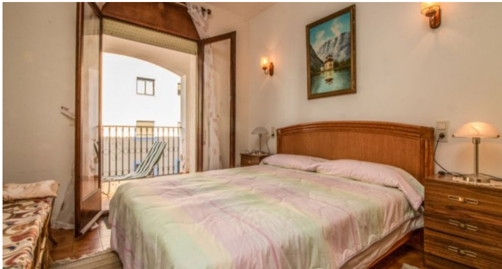
Appartement in Strandnähe in Empuriabrava