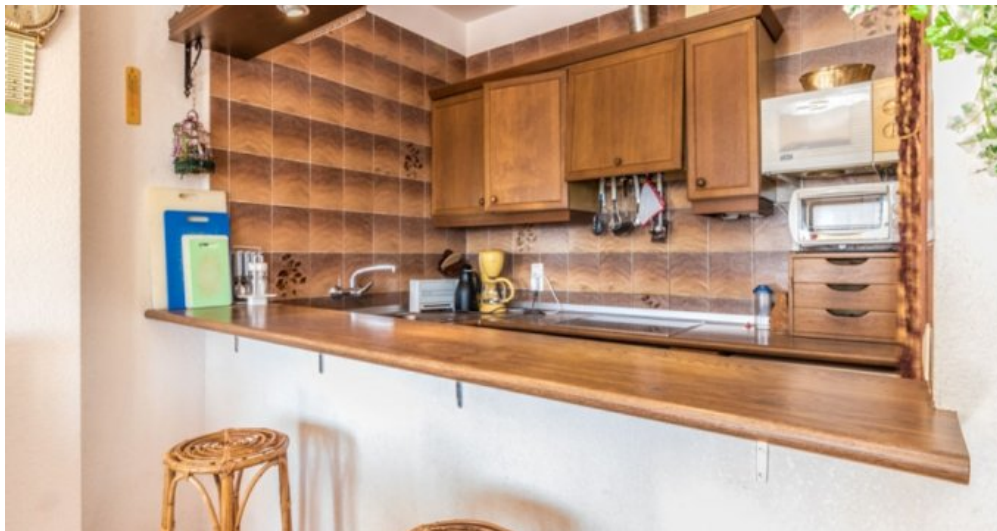
Appartement in Strandnähe in Empuriabrava