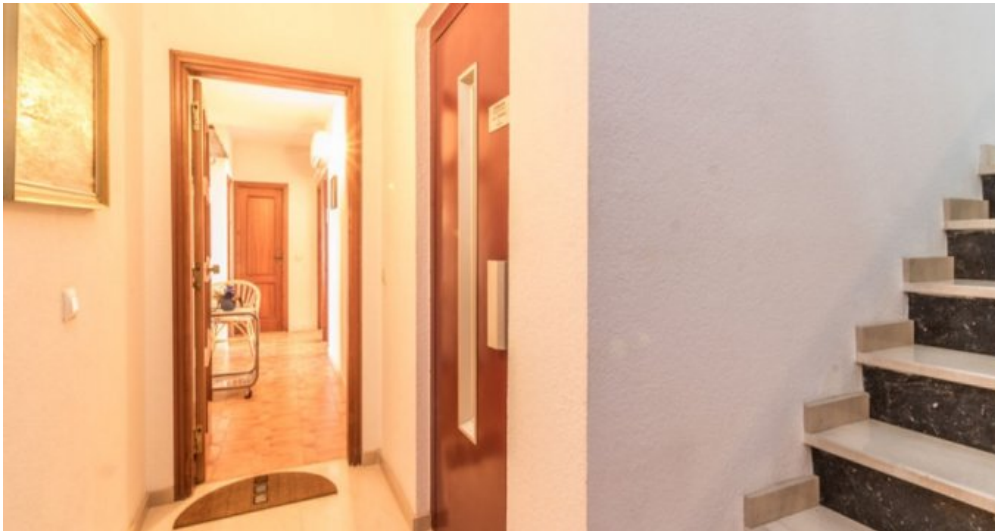
Appartement in Strandnähe in Empuriabrava