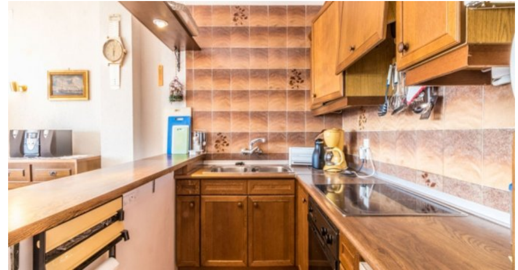
Appartement in Strandnähe in Empuriabrava