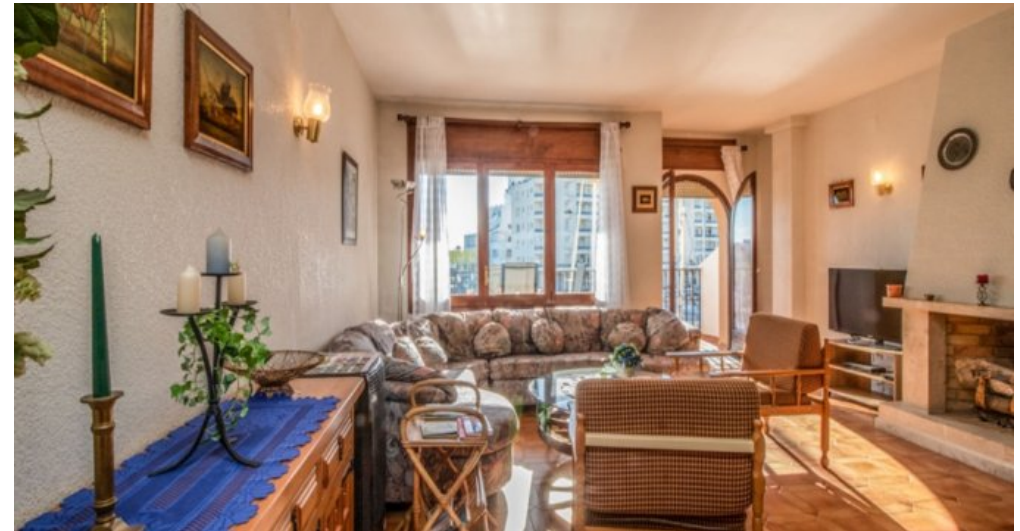
Appartement in Strandnähe in Empuriabrava