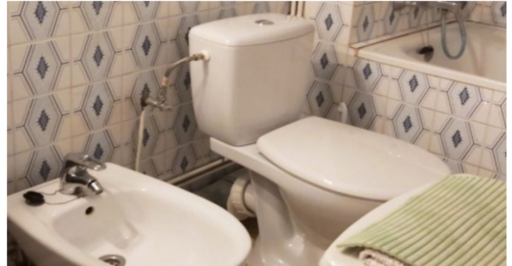
Appartement/Studio am Strand von Empuriabrava