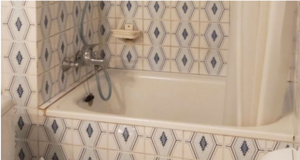
Appartement/Studio am Strand von Empuriabrava