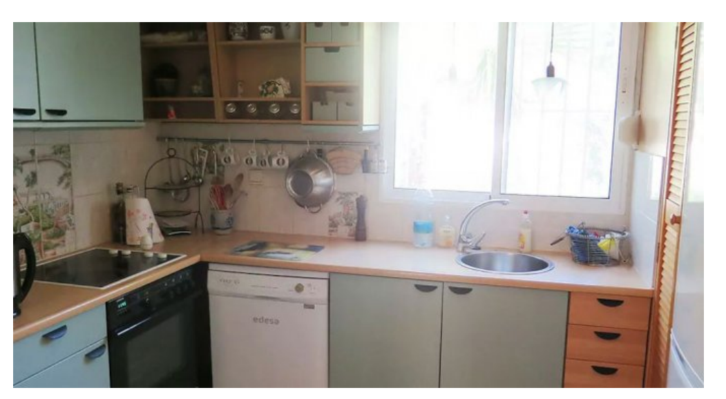
Im Verkauf:Ferienhaus Roses Costa Brava privater Pool