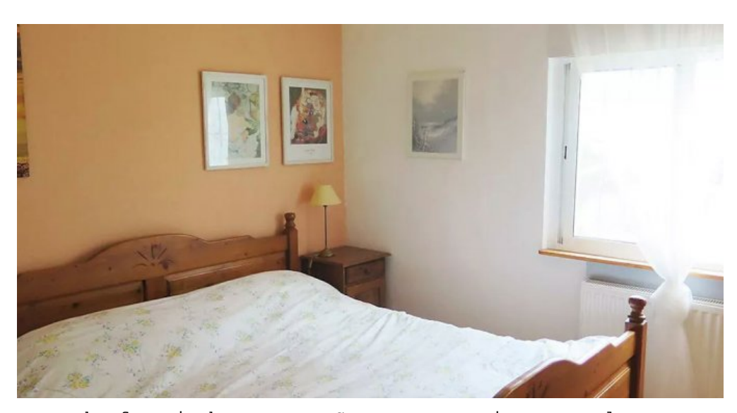
Im Verkauf:Ferienhaus Roses Costa Brava privater Pool