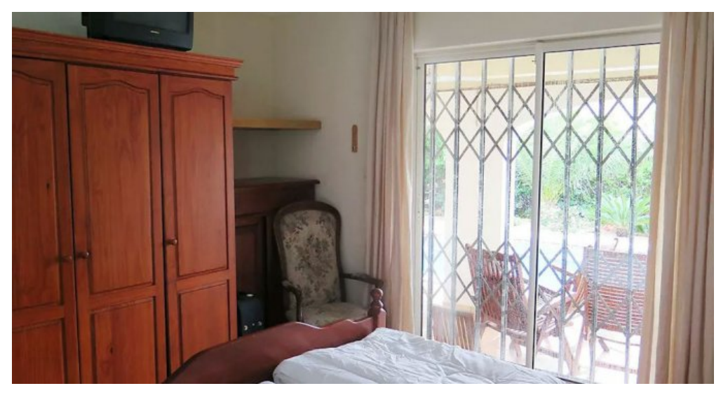
Im Verkauf: Ferienhaus Roses Costa Brava privater Pool