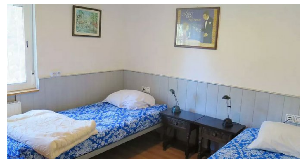
Im Verkauf:Ferienhaus Roses Costa Brava privater Pool