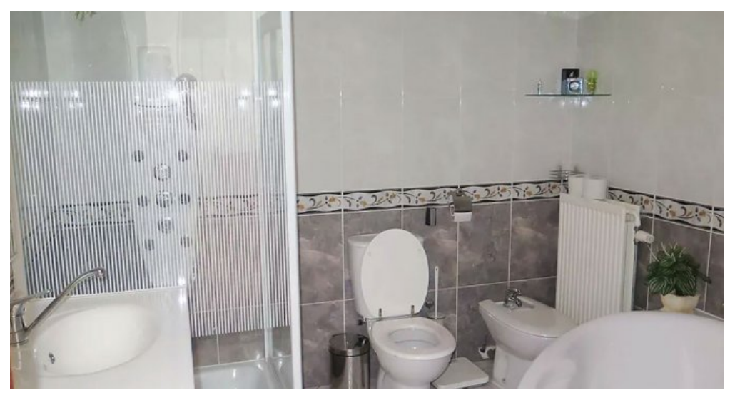
Im Verkauf: Ferienhaus Roses Costa Brava privater Pool