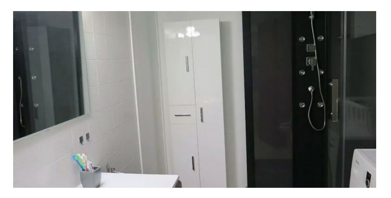
A true opportunity to experience the Mediterranean lifestyle in an idyllic setting.