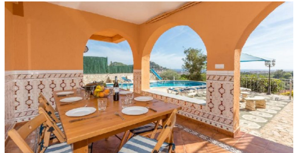
Großes Ferienhaus in Blanes zu verkaufen