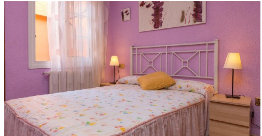
Großes Ferienhaus in Blanes zu verkaufen