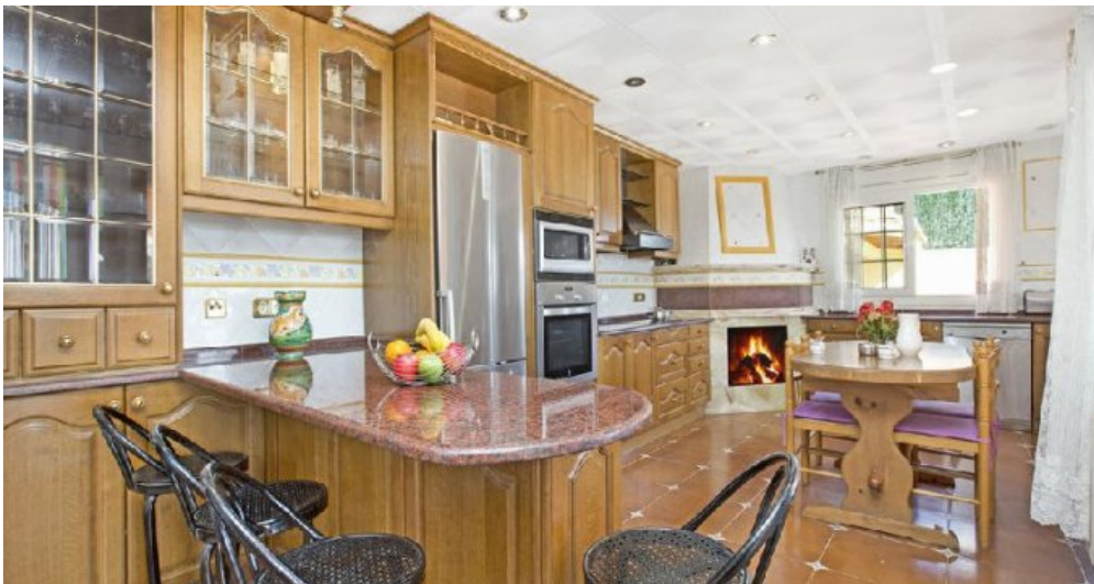
Großes Ferienhaus in Blanes zu verkaufen