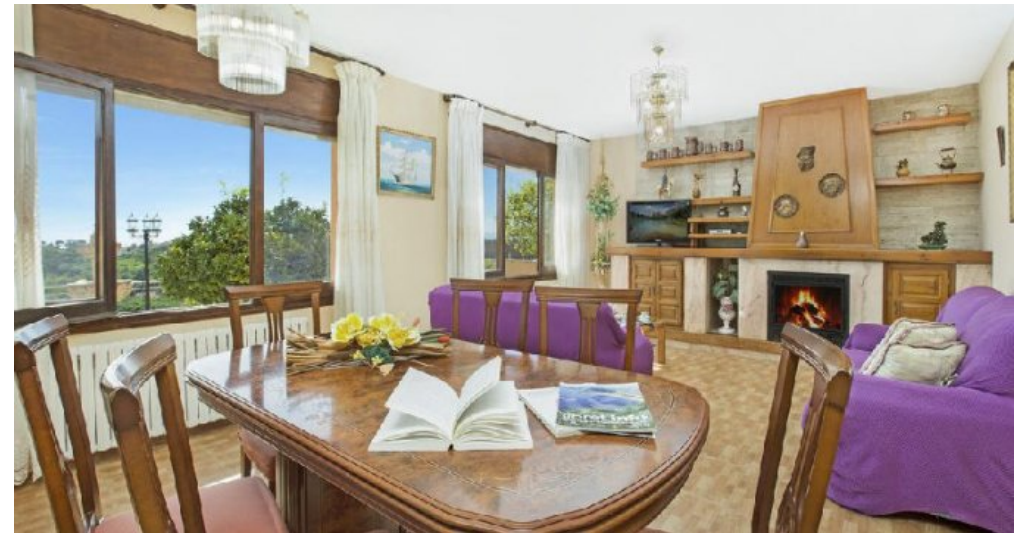
Großes Ferienhaus in Blanes zu verkaufen