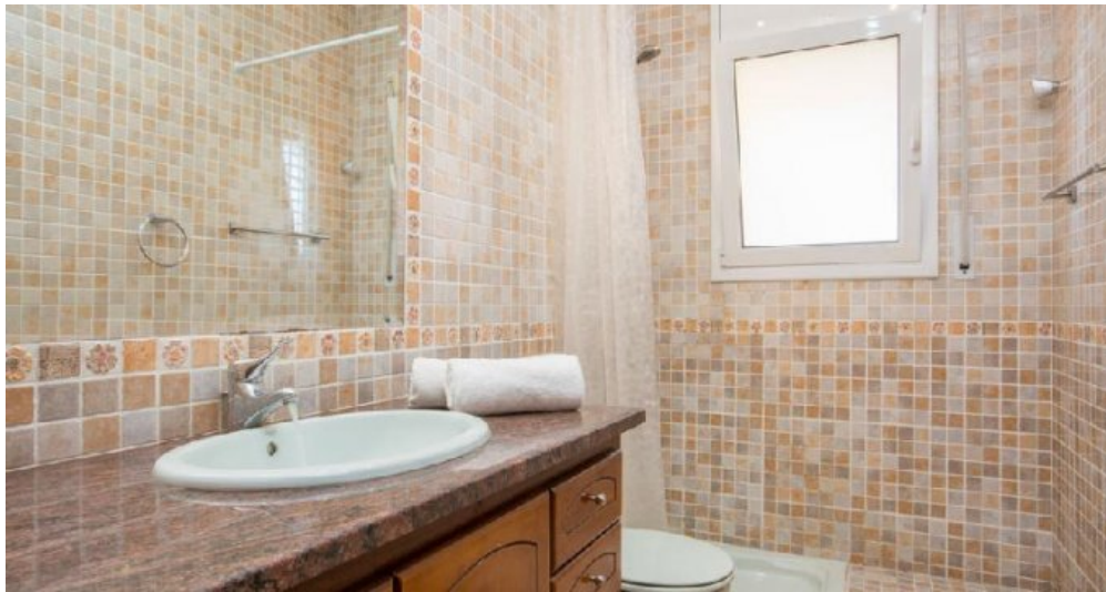
Großes Ferienhaus in Blanes zu verkaufen