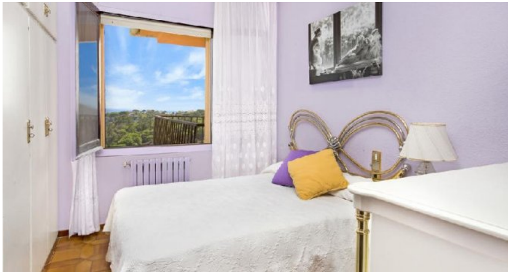
Großes Ferienhaus in Blanes zu verkaufen