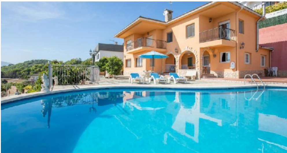
Großes Ferienhaus in Blanes zu verkaufen