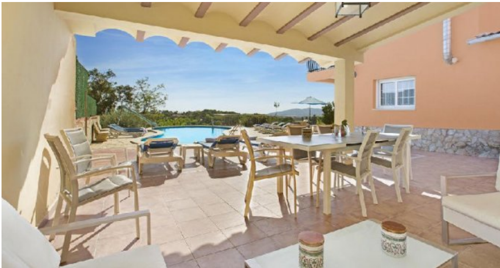
Großes Ferienhaus in Blanes zu verkaufen