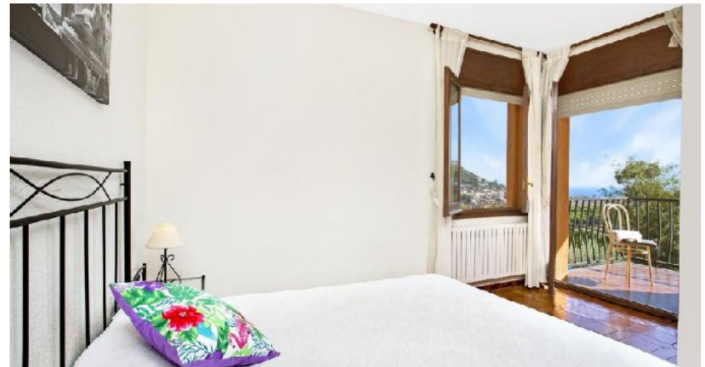
Großes Ferienhaus in Blanes zu verkaufen