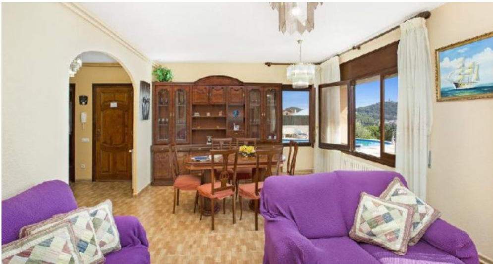
Großes Ferienhaus in Blanes zu verkaufen