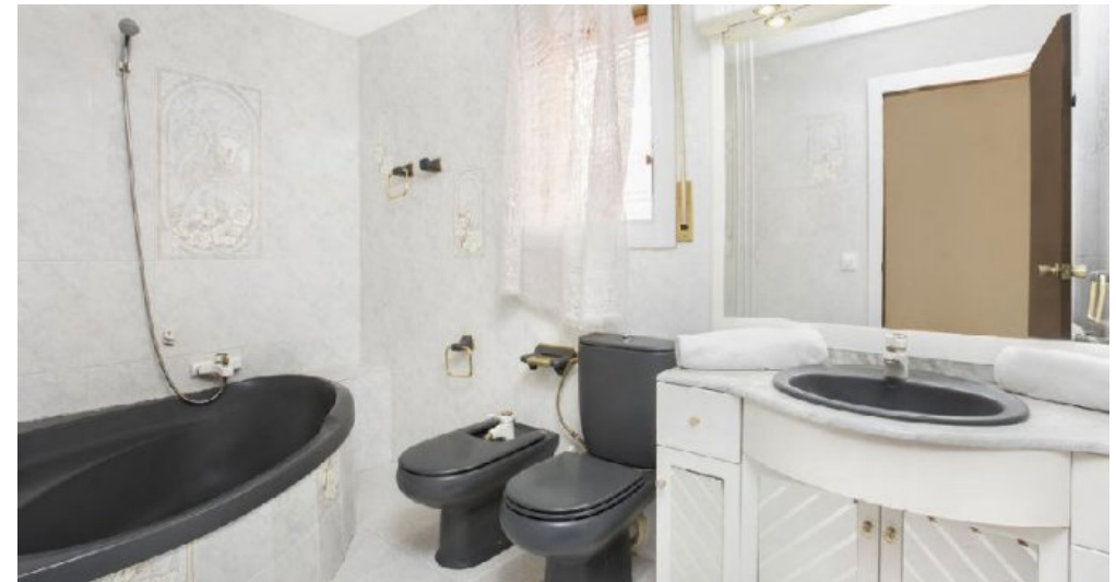
Großes Ferienhaus in Blanes zu verkaufen