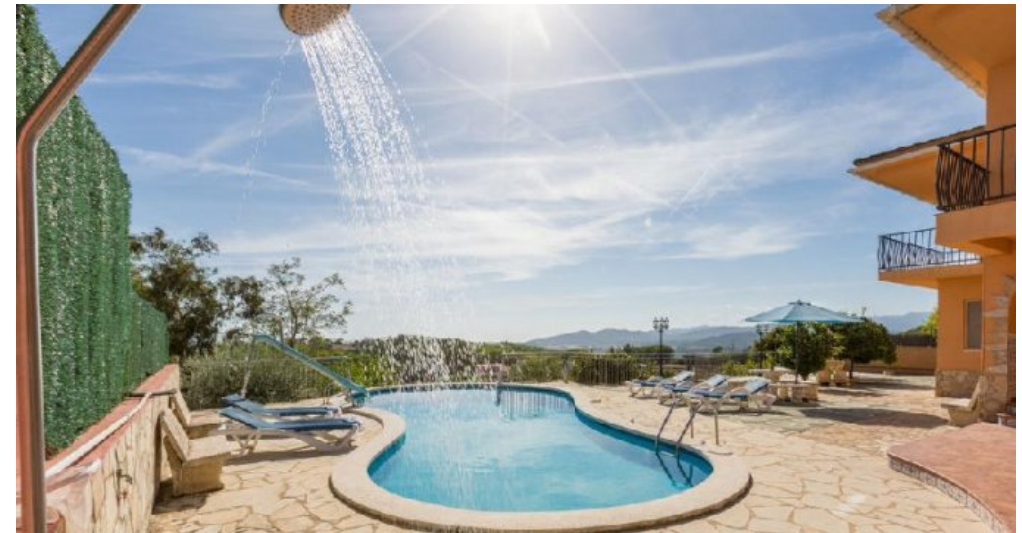
Großes Ferienhaus in Blanes zu verkaufen