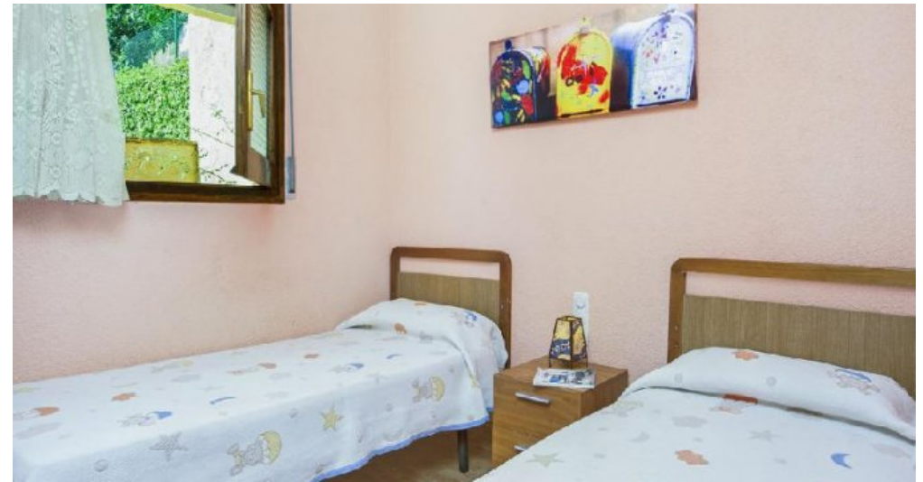
Großes Ferienhaus in Blanes zu verkaufen