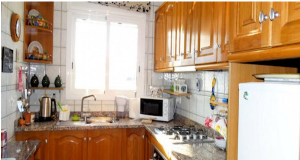
Spanien Costa Brava Ferienhaus privater Pool in L'Escala