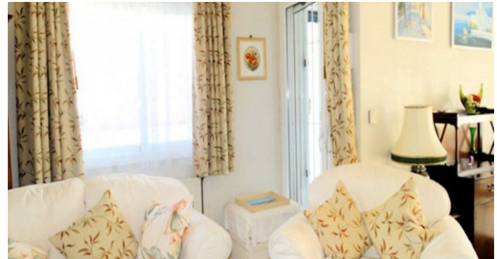
Spanien Costa Brava Ferienhaus privater Pool in L'Escala