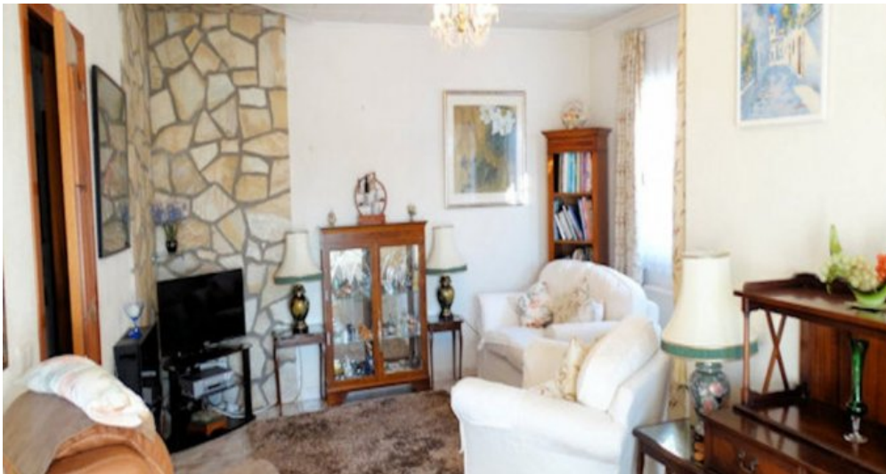
Spanien Costa Brava Ferienhaus privater Pool in L'Escala