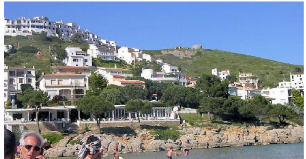
Spanien Costa Brava L`Escala