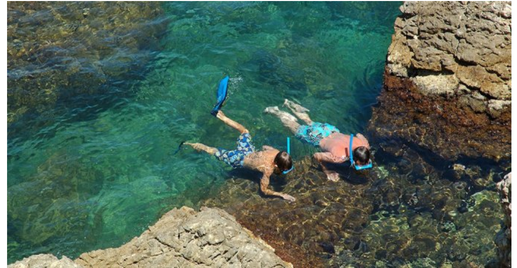
Spanien Costa Brava L'Escala