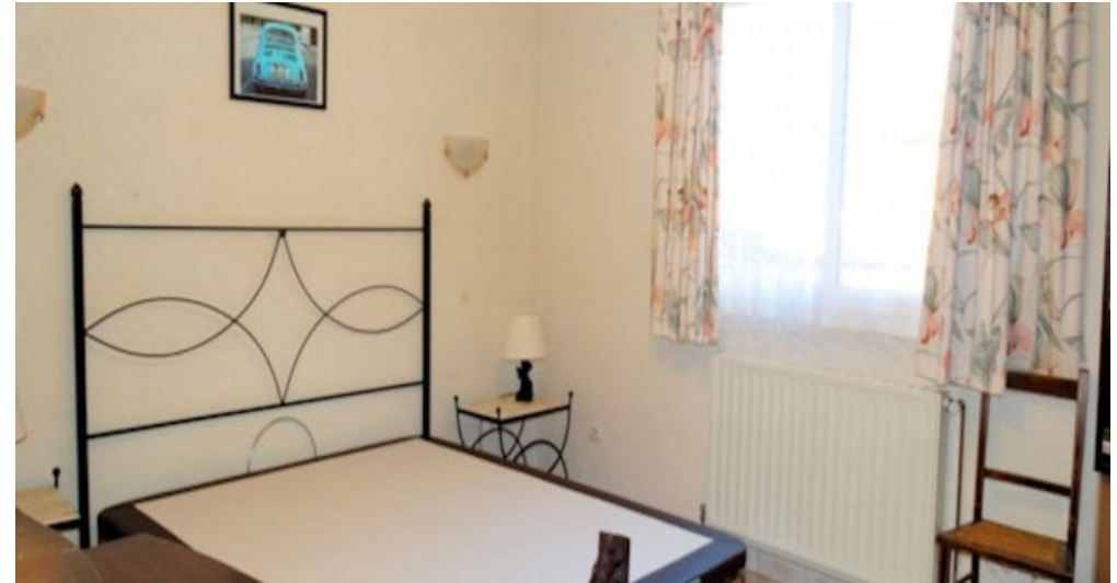
Spanien Costa Brava Ferienhaus privater Pool in L'Escala