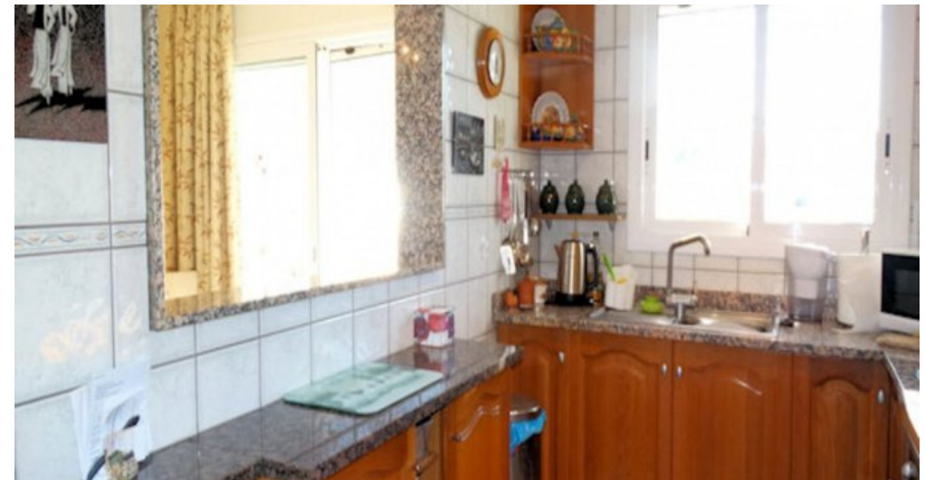
Spanien Costa Brava Ferienhaus privater Pool in L'Escala