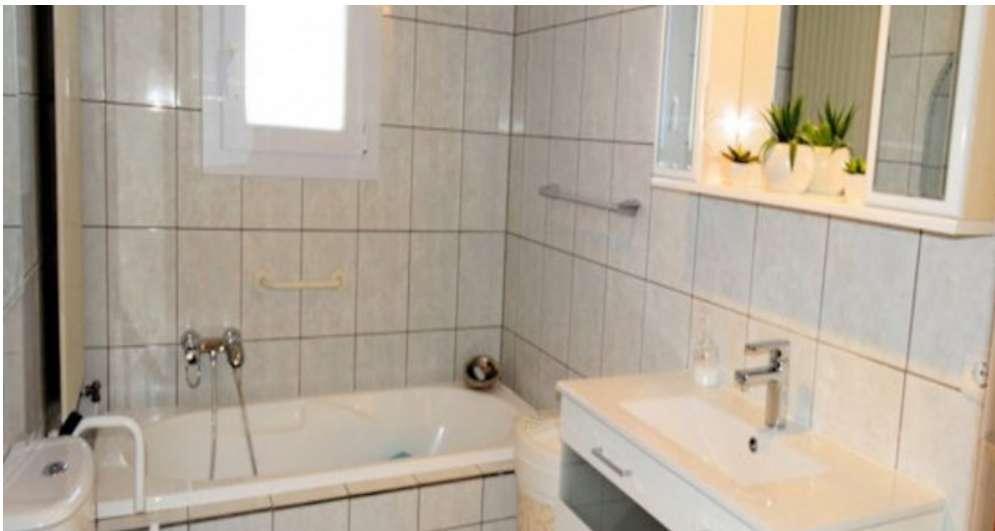
Spanien Costa Brava Ferienhaus privater Pool in L'Escala