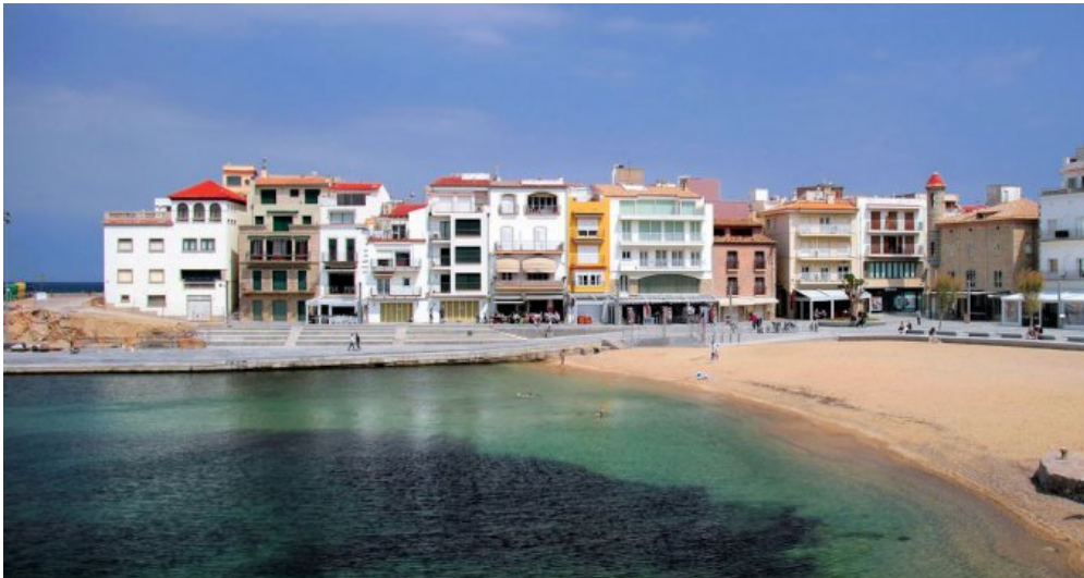
Spanien Costa Brava L'Escala