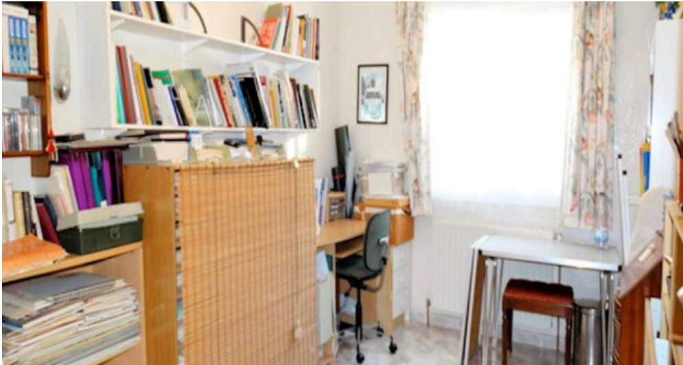
Spanien Costa Brava Ferienhaus privater Pool in L'Escala