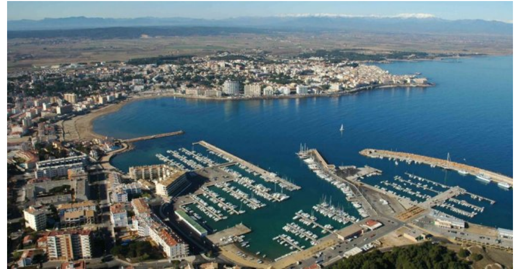
Spanien Costa Brava L`Escala