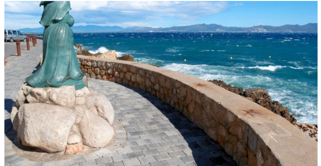
Spanien Costa Brava L