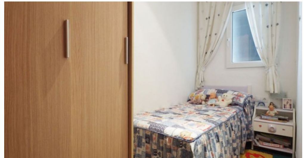
Spanien Ferienwohnung l'Escala Costa Brava