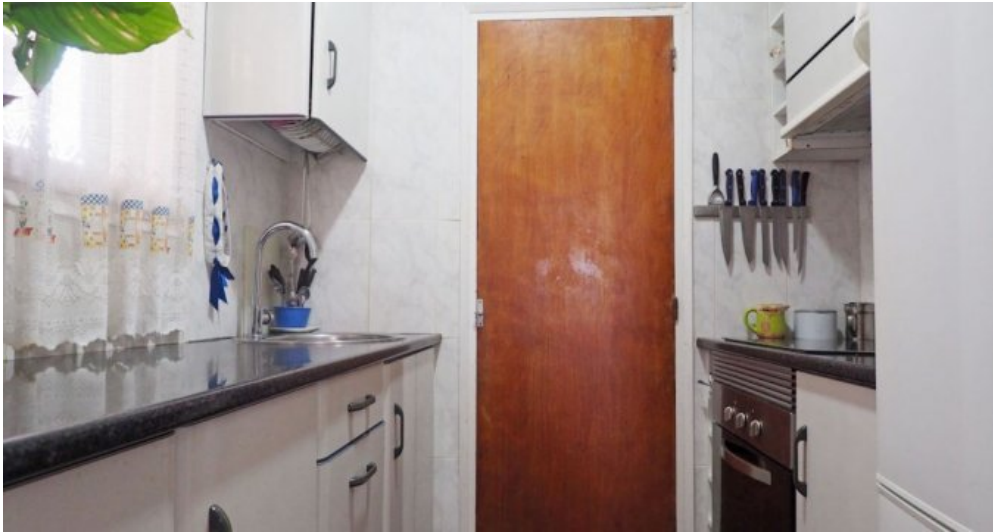
Spanien Ferienwohnung l'Escala Costa Brava