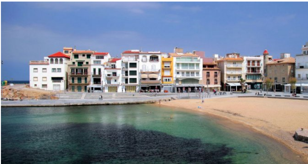
Spanien Costa Brava L`Escala