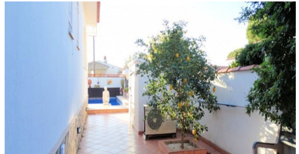
Spanien Costa Brava Ferienhaus privater Pool in L`Escala