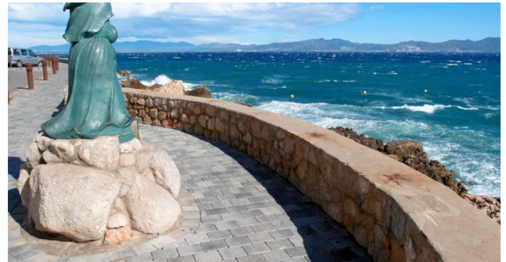
Spanien Costa Brava L