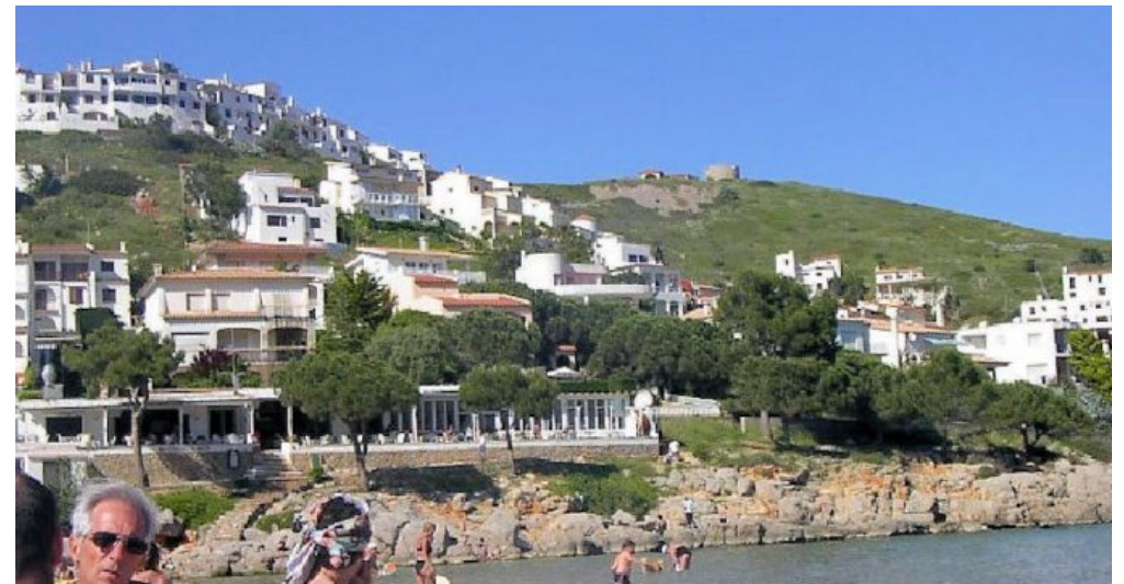
Spanien Costa Brava L`Escala