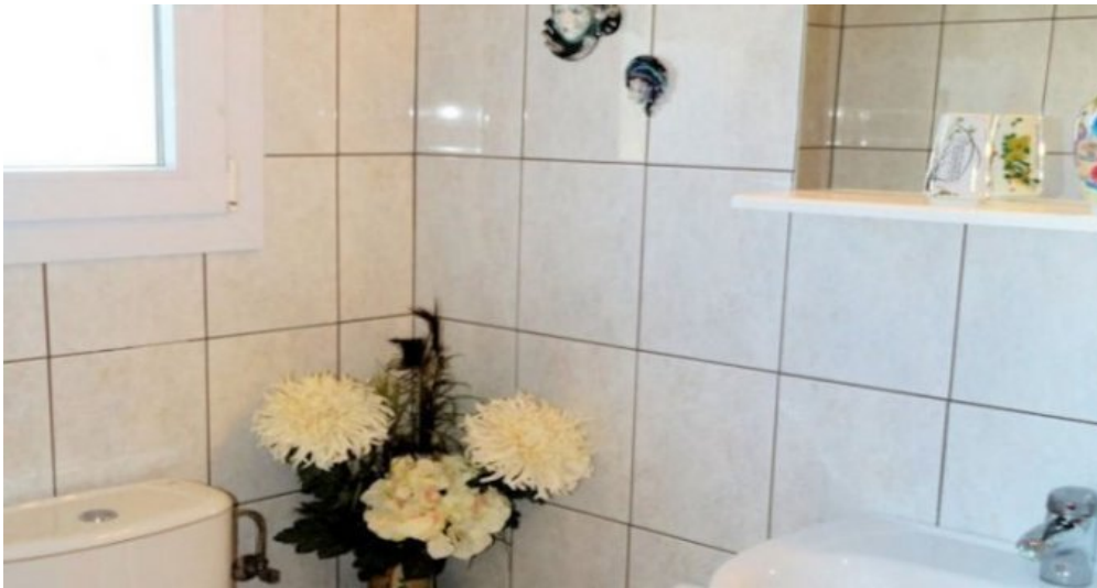
Spanien Costa Brava Ferienhaus privater Pool in L`Escala