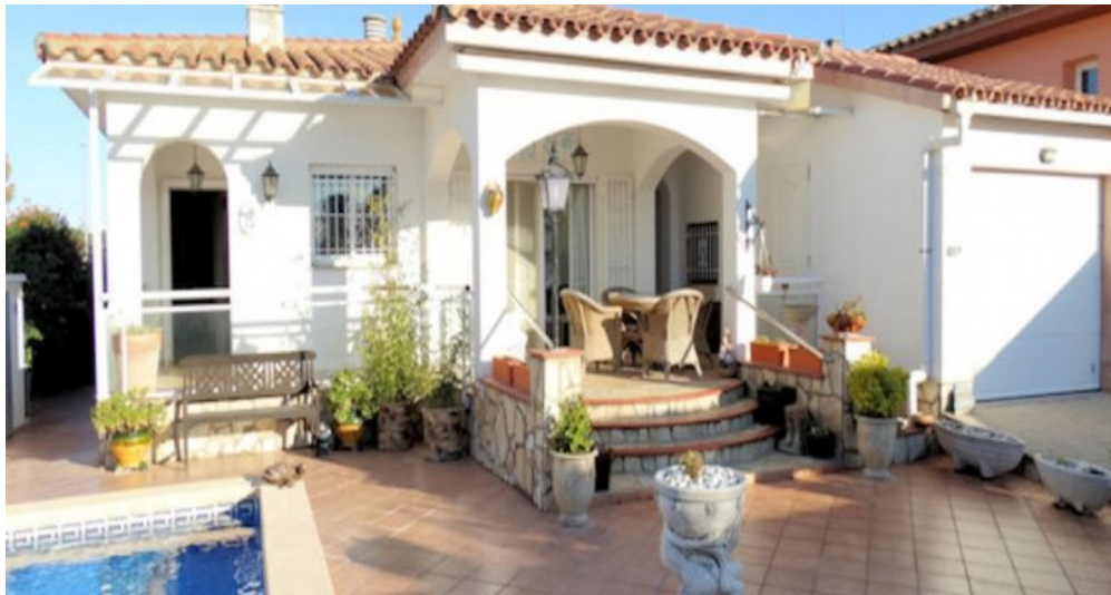
Spanien Costa Brava Ferienhaus privater Pool in L'Escala