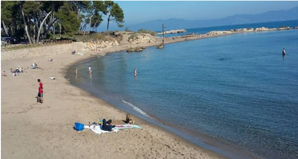
Spanien Costa Brava L`Escala