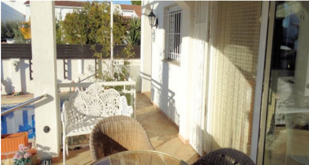
Spanien Costa Brava Ferienhaus privater Pool in L`Escala