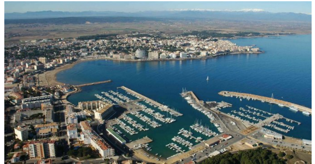
Spanien Costa Brava L`Escala