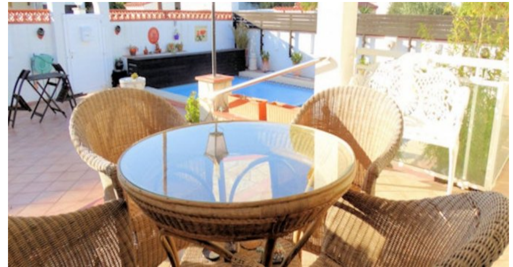
Spanien Costa Brava Ferienhaus privater Pool in L'Escala