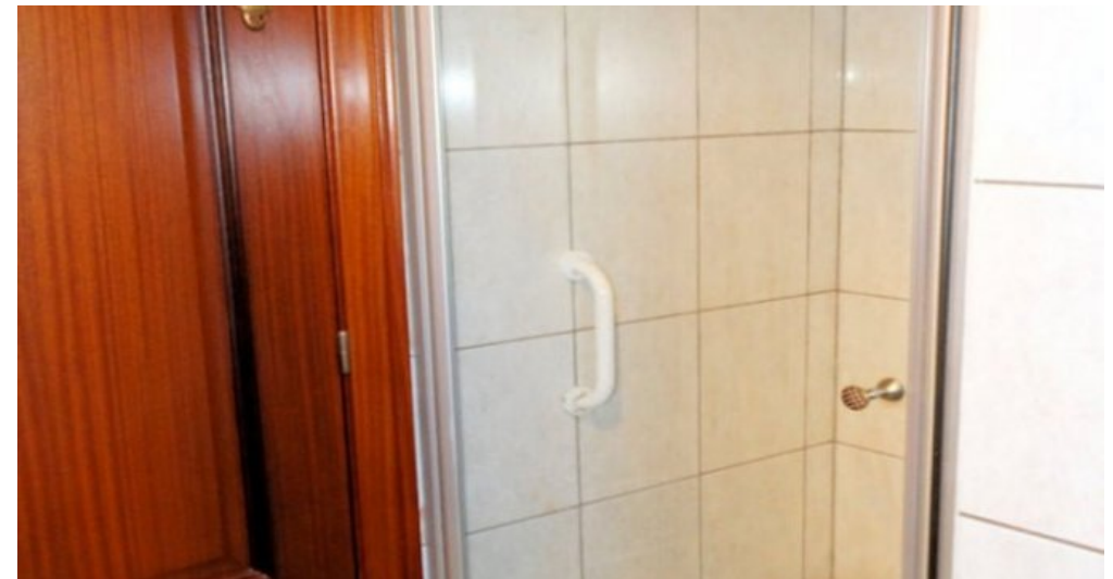
Spanien Costa Brava Ferienhaus privater Pool in L`Escala