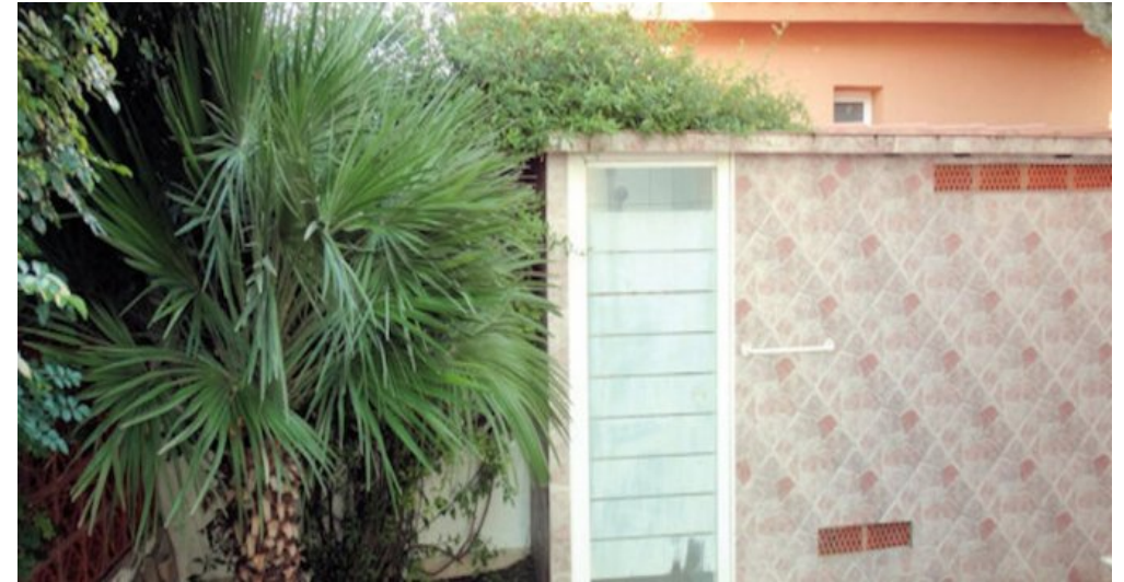
Spanien Costa Brava Ferienhaus privater Pool in L`Escala