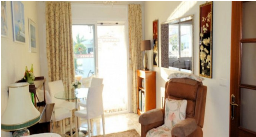
Spanien Costa Brava Ferienhaus privater Pool in L'Escala