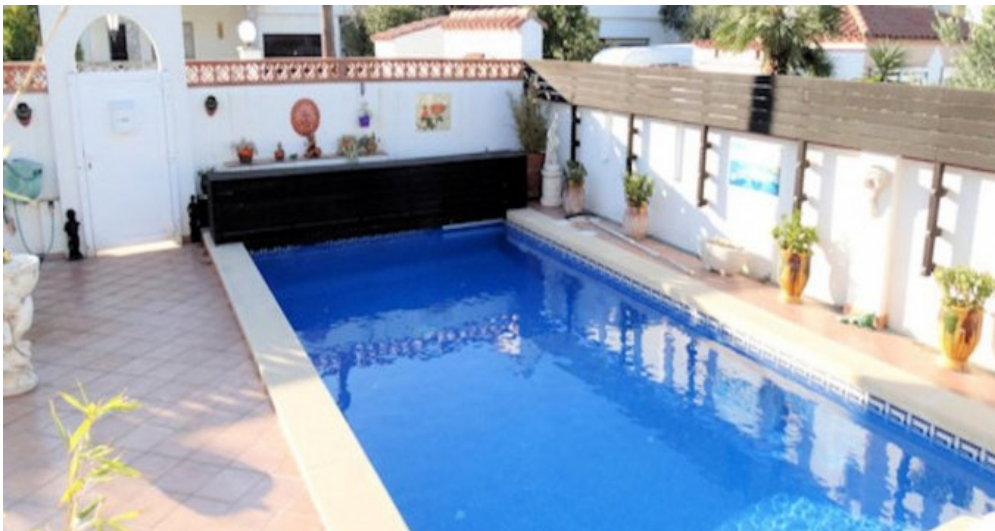
Spanien Costa Brava Ferienhaus privater Pool in L`Escala