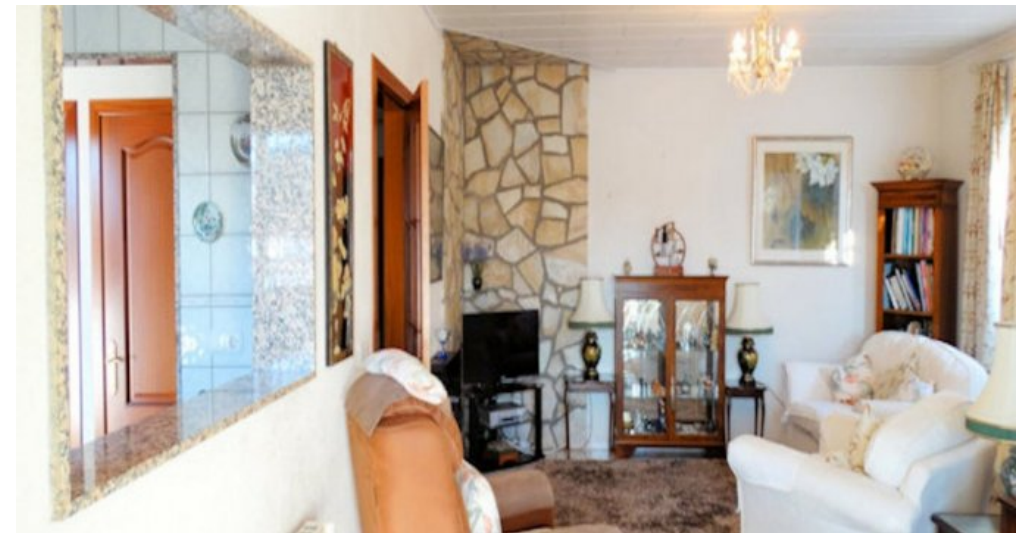
Spanien Costa Brava Ferienhaus privater Pool in L'Escala