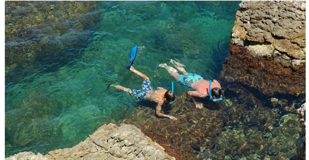
Spanien Costa Brava L`Escala