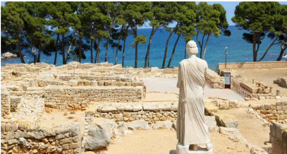
Spanien Costa Brava L`Escala