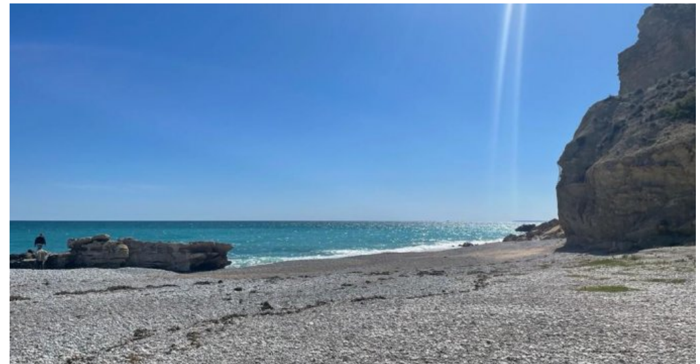
Beach Apartment Villajoyosa zu verkaufen