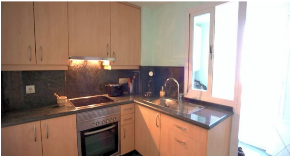
Beach Apartment Villajoyosa zu verkaufen