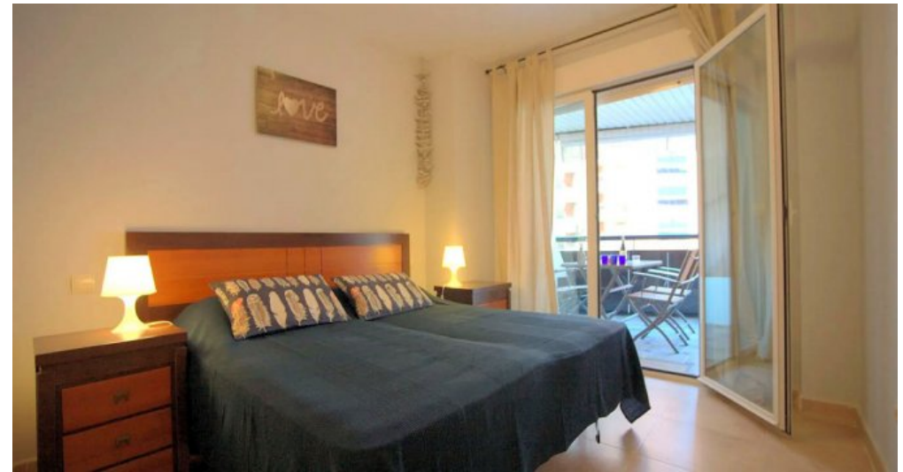
Beach Apartment Villajoyosa zu verkaufen