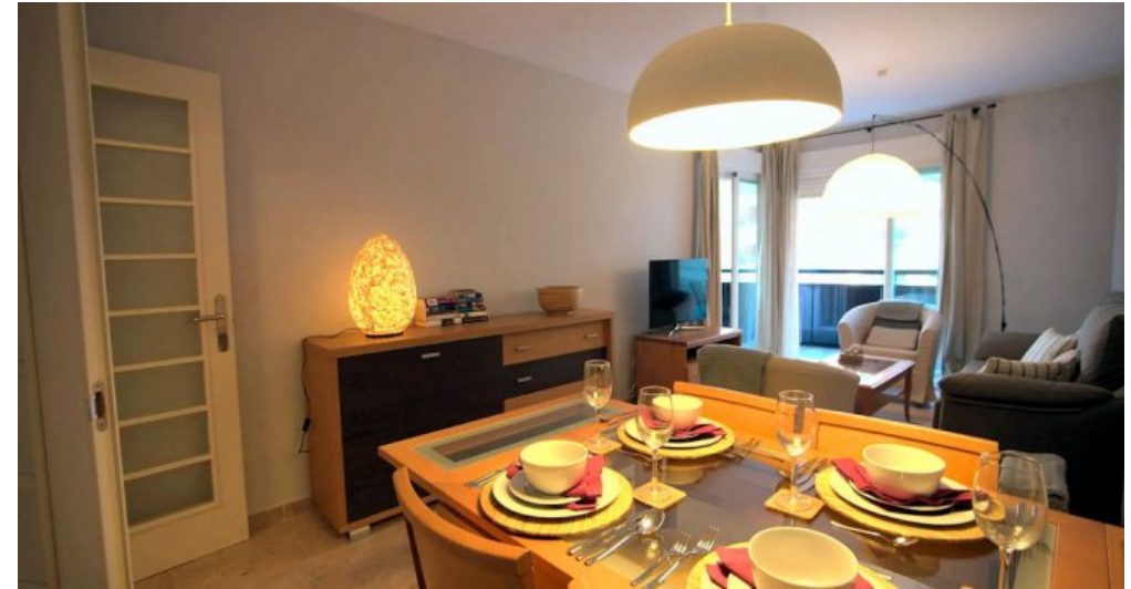
Beach Apartment Villajoyosa zu verkaufen