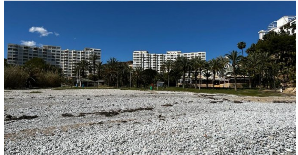
Beach Apartment Villajoyosa zu verkaufen