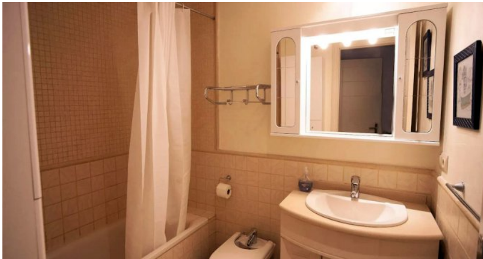
Beach Apartment Villajoyosa zu verkaufen