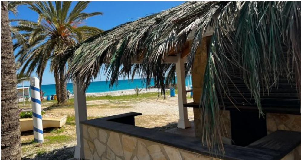
Beach Apartment Villajoyosa zu verkaufen