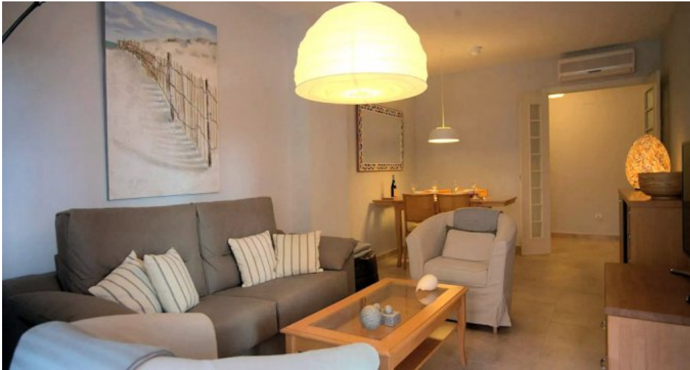
Beach Apartment Villajoyosa zu verkaufen