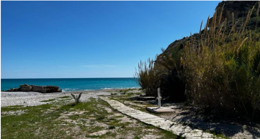
Beach Apartment Villajoyosa zu verkaufen